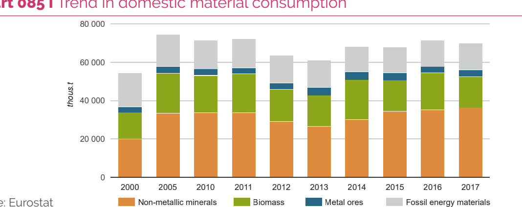
Chart 085 I Trend in domestic material consumption