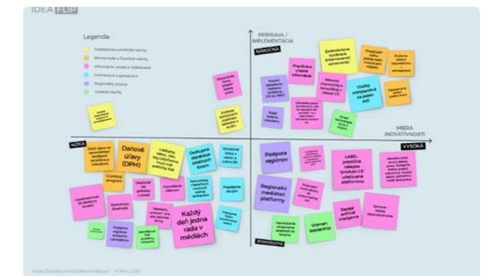
The final output from design thinking workshop

Seminar participants came with a lot of ideas on how the circular platform in Slovakia should look. Most ideas were connected with awareness-raising, information sharing, such as offering media space for companies active in the circular economy, awarding circular business models and organizing field trips to front running companies.