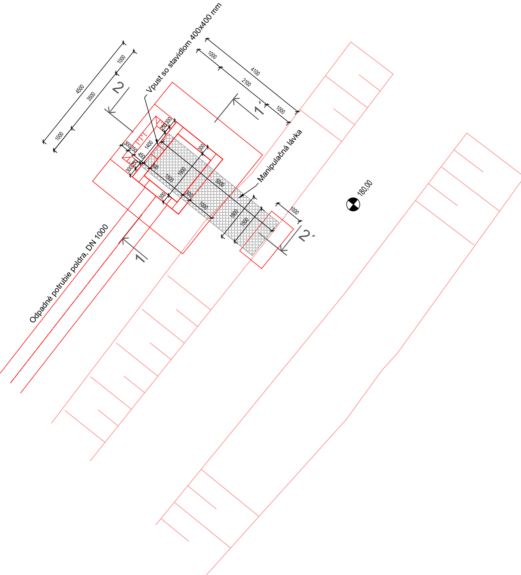
Objekt hrádzového telesa SO 01